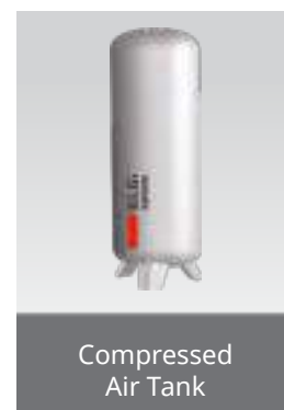
Compressed Air Tank