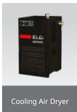
Cooling Air Dryer