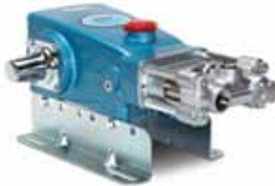
820 (Rails and shaft protector sold separately)