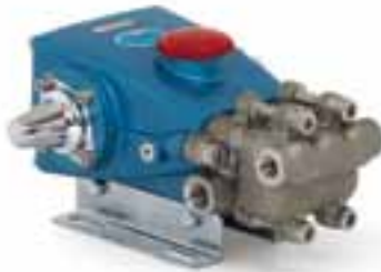
271 (Rails and shaft protector sold separately)