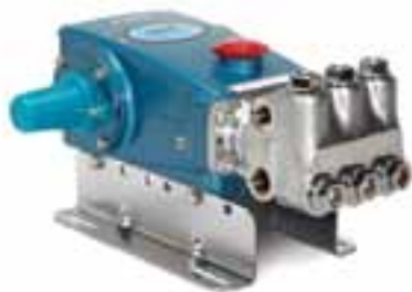
1050 (Rails and shaft protector sold separately)