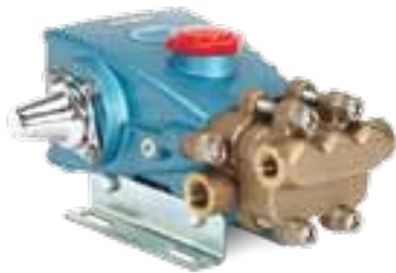
277 (Rails and shaft protector sold separately)