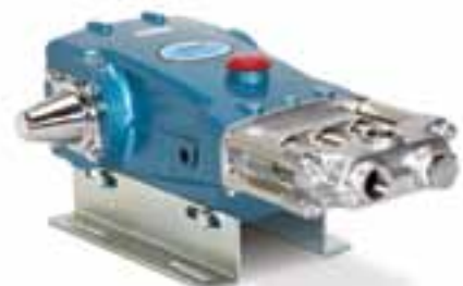
2520 (Rails and shaft protector sold separately)