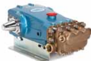
2537 (Rails and shaft protector sold separately)