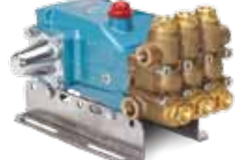
5CP3120 (Rails and shaft protector sold separately)