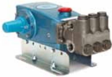
1051 (Rails and shaft protector sold separately)