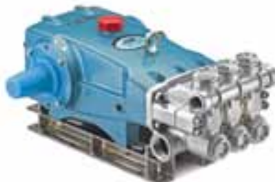
3535 (Rails sold separately)