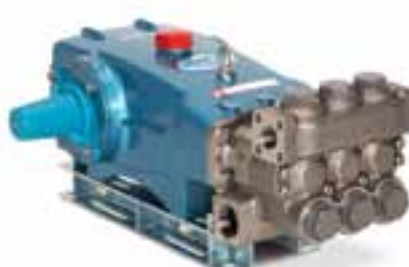
3531 (Rails sold separately)