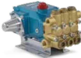
3CP1130 (Rails and shaft protector sold separately)