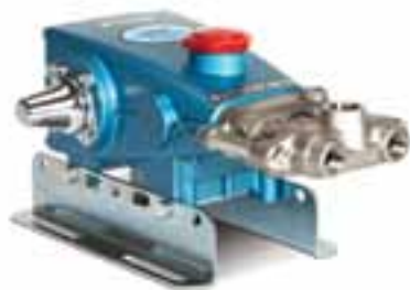
280 (Rails and shaft protector sold separately)