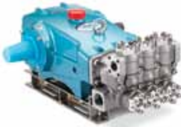
3511 (Rails sold separately)