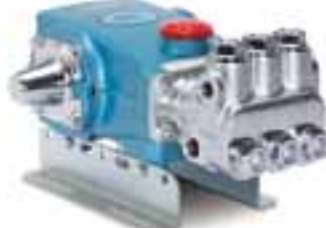
550 (Rails and shaft protector sold separately)