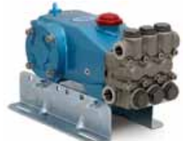
7CP6111 (Rails sold separately)