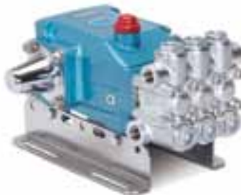
5CP2120W (Rails and shaft protector sold separately)