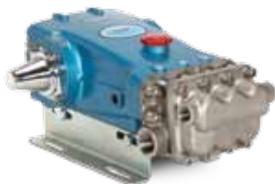
2531 (Rails and shaft protector sold separately)