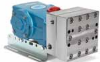
781 (Rails sold separately)