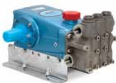
1541 (Rails and shaft protector sold separately)