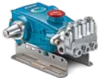
310 (Rails and shaft protector sold separately)